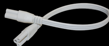
12" Linkable Cable Connector